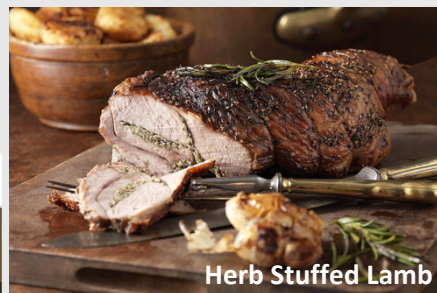
Herb Stuffed Lamb