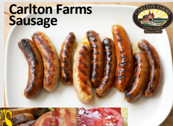
Carlton Farms Sausage