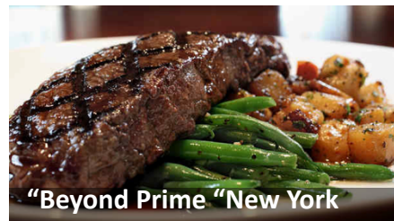
"Beyond Prime" New York