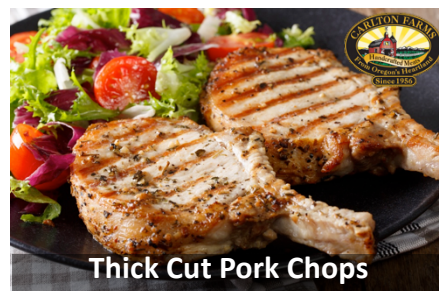
Thick Cut Pork Chops