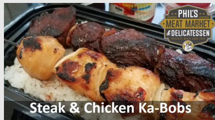
Steak & Chicken Ka-Bobs