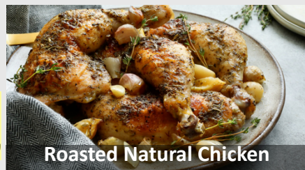
Roasted Natural Chicken